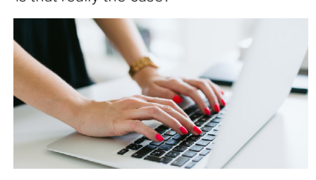
STANDING DESKS Read on to find out if standing desks really can boost our health.